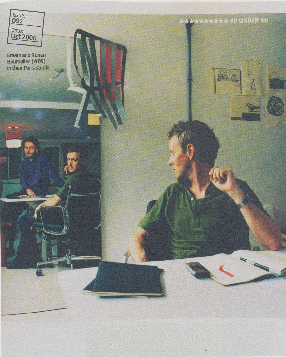
Issue: 092 Date: Oct 2006

Oki Sato took Milan by storm in April with an audacious retrospective of his work over a single year, showcasing his impressive range and attention to detail in collaborations with companies ranging from Glas Italia and Moroso to Chocolatexture and Tod's. In fact, he designed more than 100 different products over the year, and routinely works on more than 400 designs at any one time. This year, Sato, who initially set up Nendo ten years ago with five fellow architecture graduates, also received the crown for Maison & Objet's Designer of the Year, opened a Milan office, and shifted into large scale architectural projects for the first time, winning commissions for a shopping centre in Bangkok and a station and leisure complex in Kyoto.