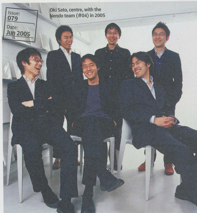
Issue: 079 Date: Jun 2005

From health-tracking wristbands to app-controlled thermostats, Béhar is the designer for our perma-connected age. Last year, Chinese conglomerate BlueFocus Communication Group acquired a majority stake in his firm Fuseproject. His XO laptops for One Laptop Per Child are now distributed in 60 countries.